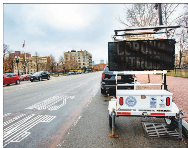
A Coronavirus sign on Washington Street by Blackstone Park.