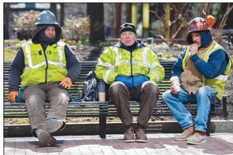
Boston construction workers break for lunch on Monday, uncertain how long they will continue to work amidst the pandemic.