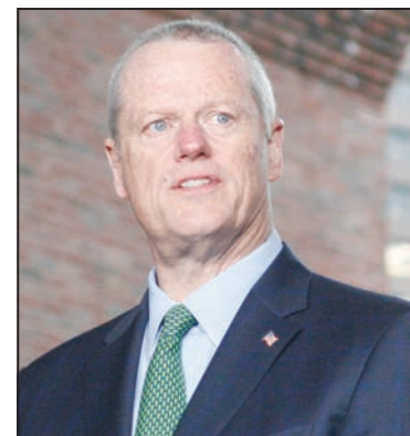
Gov. Charlie Baker will file a bill to make Sept. 14 Marathon Monday.

economy. The BAA will take every step possible to support this effort. We could not be more impressed by the immense amount of work by the City of Boston and the Commonwealth to not just cancel the Marathon, but instead take the less drastic step of postponing it even amidst a crisis of incredible proportions.”