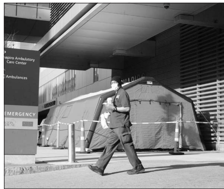
Major hospitals like Boston Medical Center (BMC), are preparing this week for a potential surge in patients with coronavirus. Here, outside the emergency room, they have set up a triage and testing tent to aid in any potential surge. Right now, it is being used for drills, but is being prepared for real use.

The federal government announced a second round of emergency funding by the Cen-