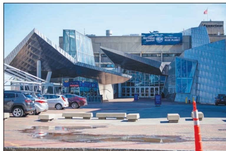
Attractions, including the New England Aquarium, close to the public.

The most up-to-date information can be found at boston.gov/coronavirus , and to sign up for the City’s daily text service to receive information, text BOSCOVID to 99411.