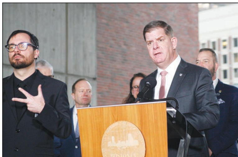
Mayor Martin Walsh announces the postponement of the Boston Marathon to Sept. 14 during a press conference on the City Hall portico last Friday, March 13. He said he hopes it can be a weekend-long festival to help businesses to rebound from the hurt caused by the COVID-19 situation.

our local economy,” he said. “Our plan is to make the weekend of September 14 a cornerstone campaign to help local businesses recover from this entire episode... You have the chance to run in an historic, once-in-a-lifetime race in September, and I hope all the runners and people will embrace it.”