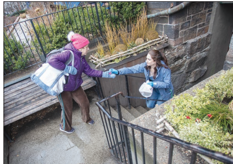
Guest Cathy B. accepts a take-out lunch and hygiene/clothing package from a WLP employee with the dining room closed.