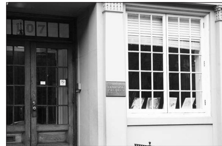
The Learning Project in the Back Bay was the first school in the Boston area to close out of a concern for social responsibility last Wednesday, March 11. School leaders said they felt the virus was closing in and they didn't want to overwhelm the health care system.

The SJC and the Appeals Court in the coming days will offer guidance with regard to oral arguments scheduled in April in these appellate courts.