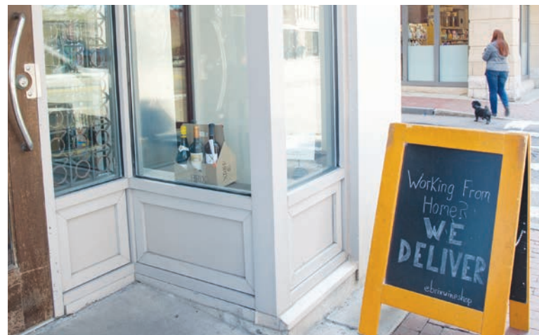
Like many businesses, the “We Deliver” sign at Brix wine shop in South End showed up Monday as businesses moved to adjust to the response.